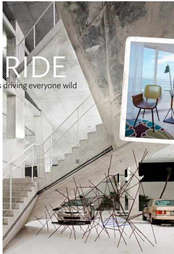
Clockwise from above: Tom Wolfe; 1111 Lincoln Road car park; the James Royal Palm Miami